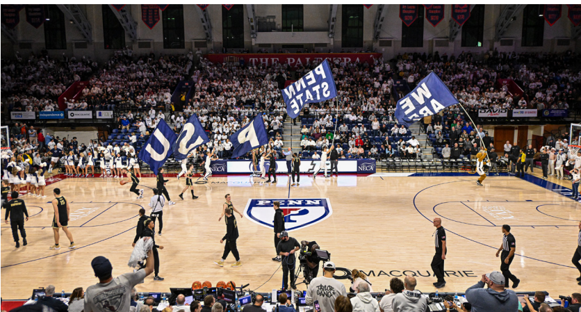
The Nittany Lions will be playing their fifth Big Ten game inside the "Cathedral of College Basketball".

Sunday's game will count as an alternate-site home game for Penn State and will be counted as a Nittany Lion home game in the NET rankings calculations.