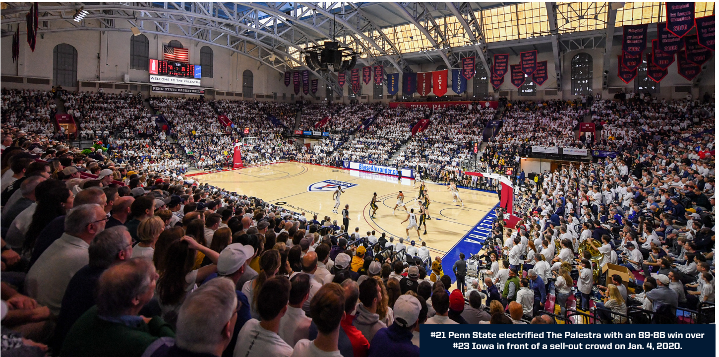
#21 Penn State electrified The Palestra with an 89-86 win over #23 Iowa in front of a sell-out crowd on Jan. 4, 2020.