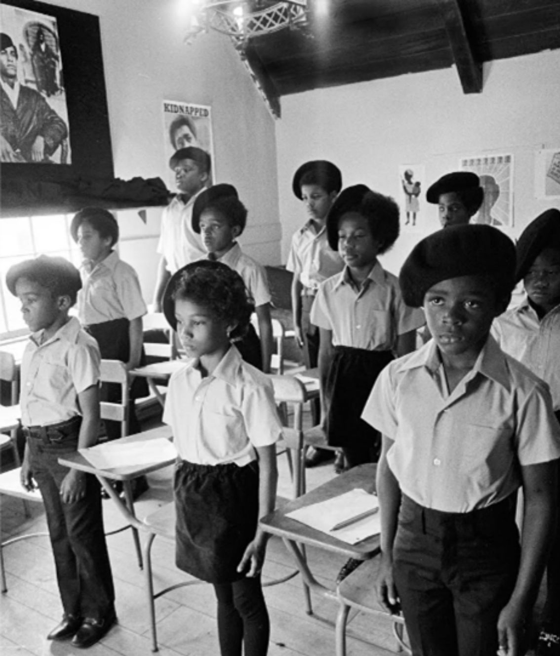
Panther School