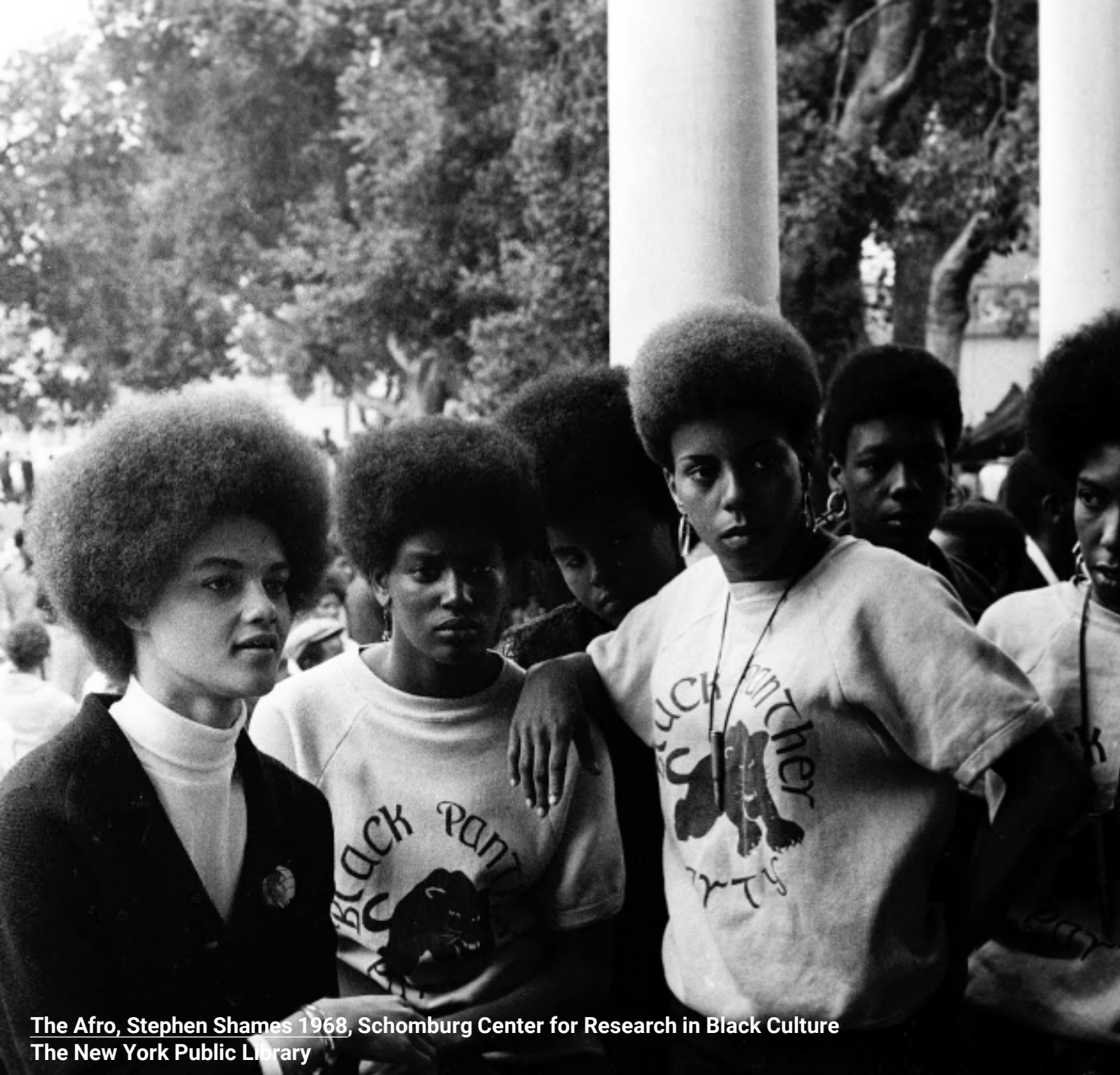
The Afro