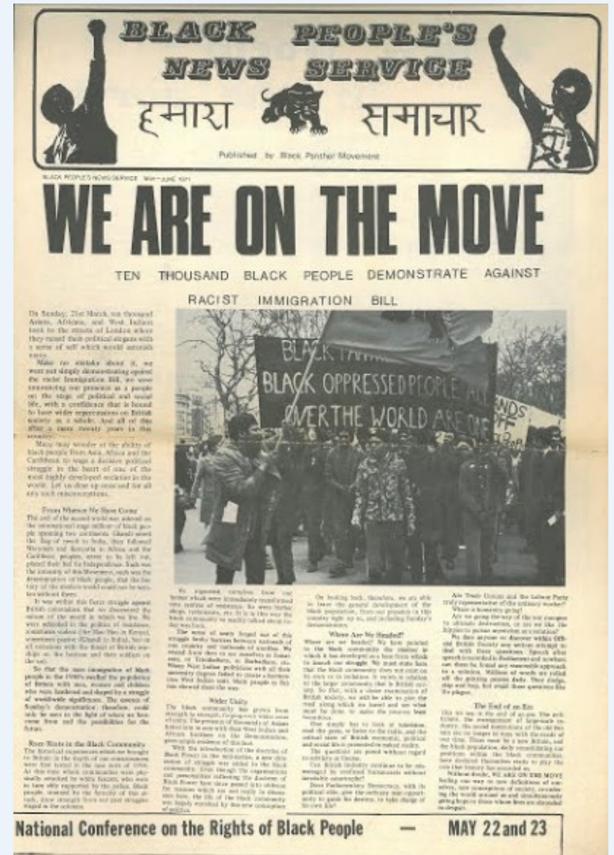
Black People's News Service, Black Panther movement 1971–05 Black Cultural Archives

To learn about a Black Power uprising in Britain in 1981, click here .