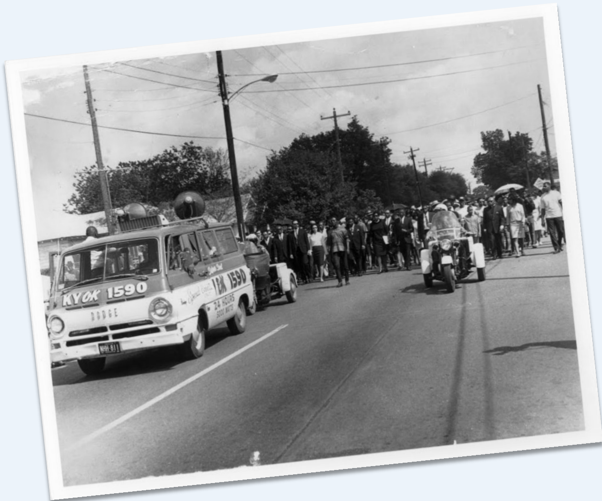
KYOK van in front of civil rights marchers 1967