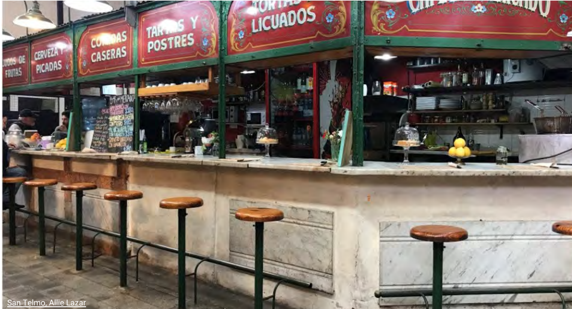
San Telmo, Allie Lazar

Originally serving as a place for immigrants to gain needed supplies and ingredients, the markets of Buenos Aires today are bustling and busy with professional and amateur chefs alike, along with those looking for specialty ingredients or to sample some of the wares of top-notch food stalls. Many of the markets in the city have been around for decades—some even date back to the late 1800s and early 1900s.