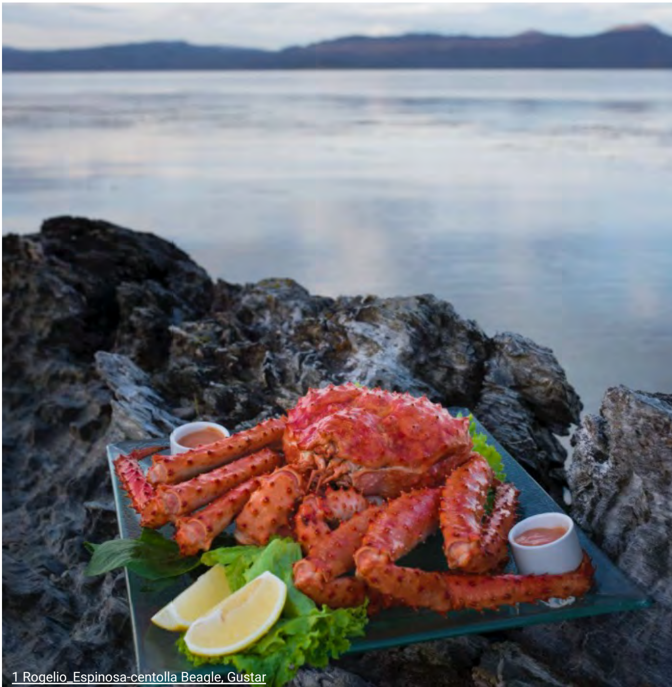
1 Rogelio_Espinosa-centolla Beagle, Gustar