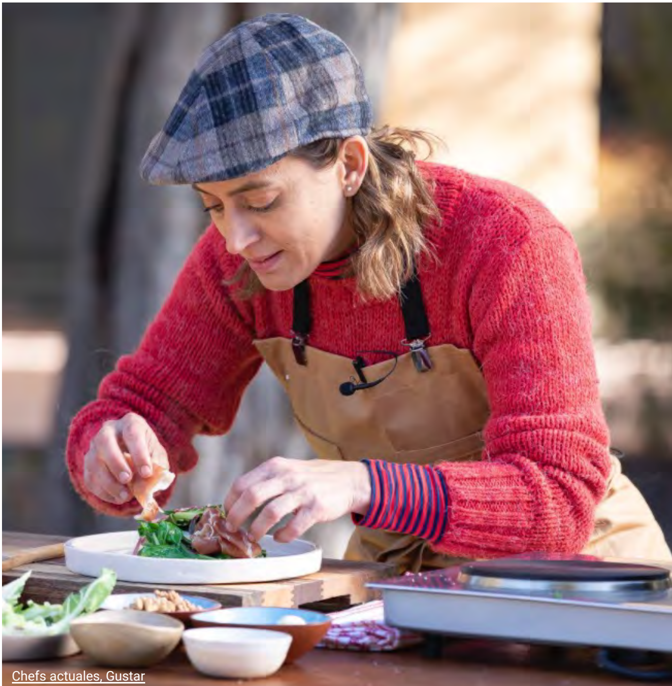
Chefs actuales, Gustar