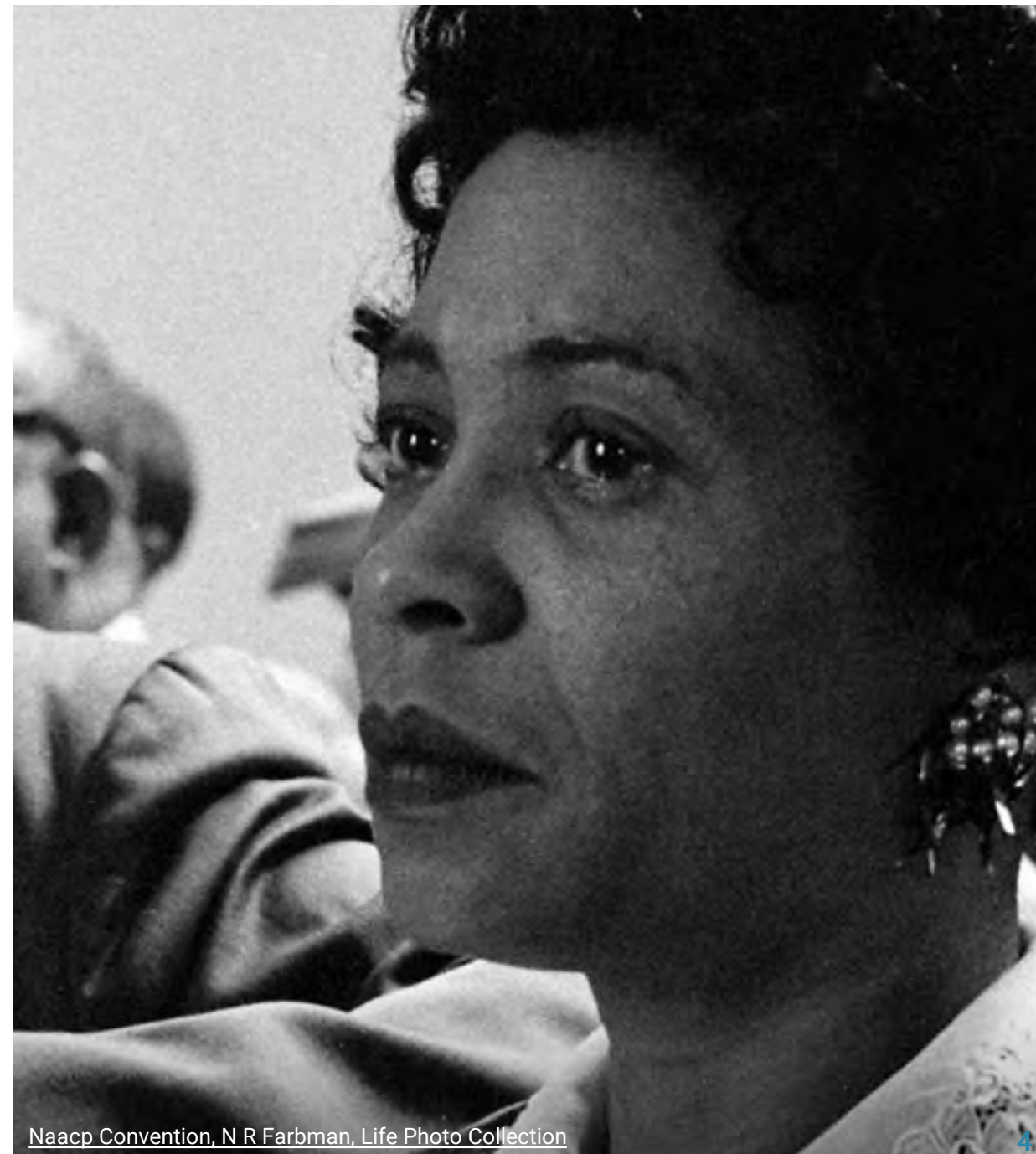
Naacp Convention