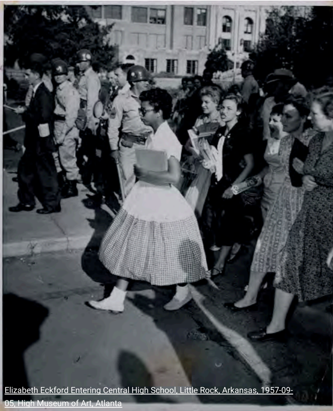
Elizabeth Eckford Entering Central High School, Little Rock, Arkansas, 1957-09-05, High Museum of Art, Atlanta