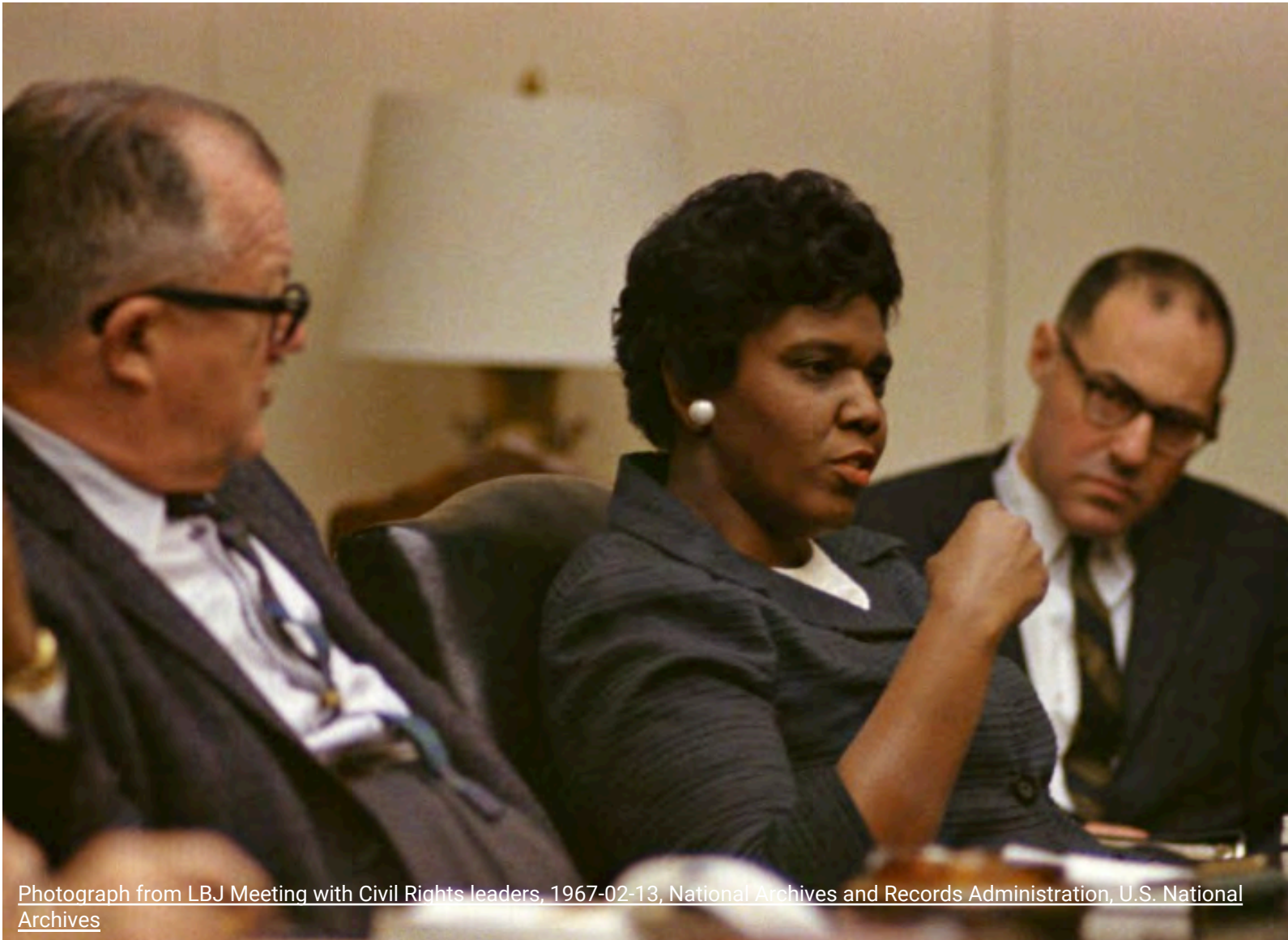
Photograph from LBJ Meeting with Civil Rights leaders, 1967-02-13

Texas state senator Barbara Jordan (center) and other civil rights leaders meeting with President Lyndon B. Johnson in 1967.