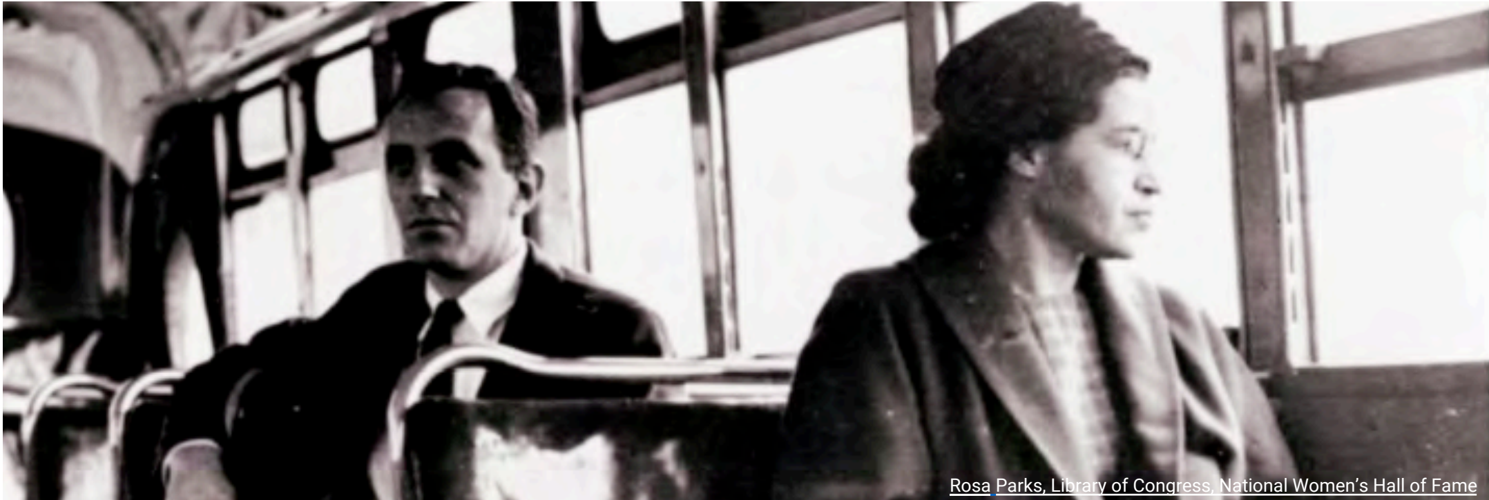
Rosa Parks

Learn more about Parks's arrest and the Montgomery bus boycott in this video . Watch this video to hear more about the activism of Rosa Parks and other civil rights leaders.