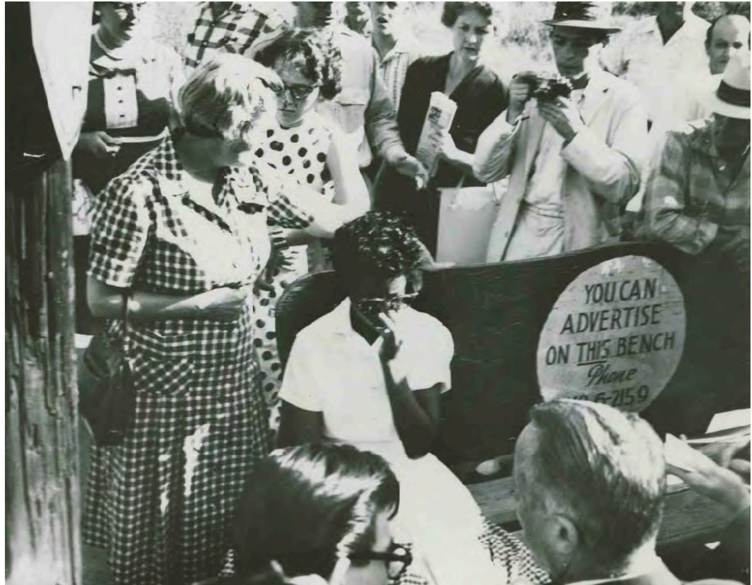
Elizabeth Eckford Waits for Bus After Being Denied Entry into Central High School, 1957-09-03

The nine students Daisy Bates recruited have become known as the Little Rock Nine . One of the most famous images from the integration of Central High School was that of 15-year-old Elizabeth Eckford, shown here, seated. Eckford is waiting for a bus after being denied entry to the high school. She hadn't received notice that the desegregation was postponed by a day. The following day, all nine students entered the high school under armed guard.