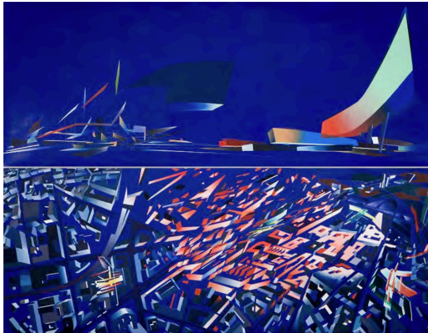
Victoria City Aerial: Aerial Perspective, Zaha Hadid, 1988, Serpentine Galleries