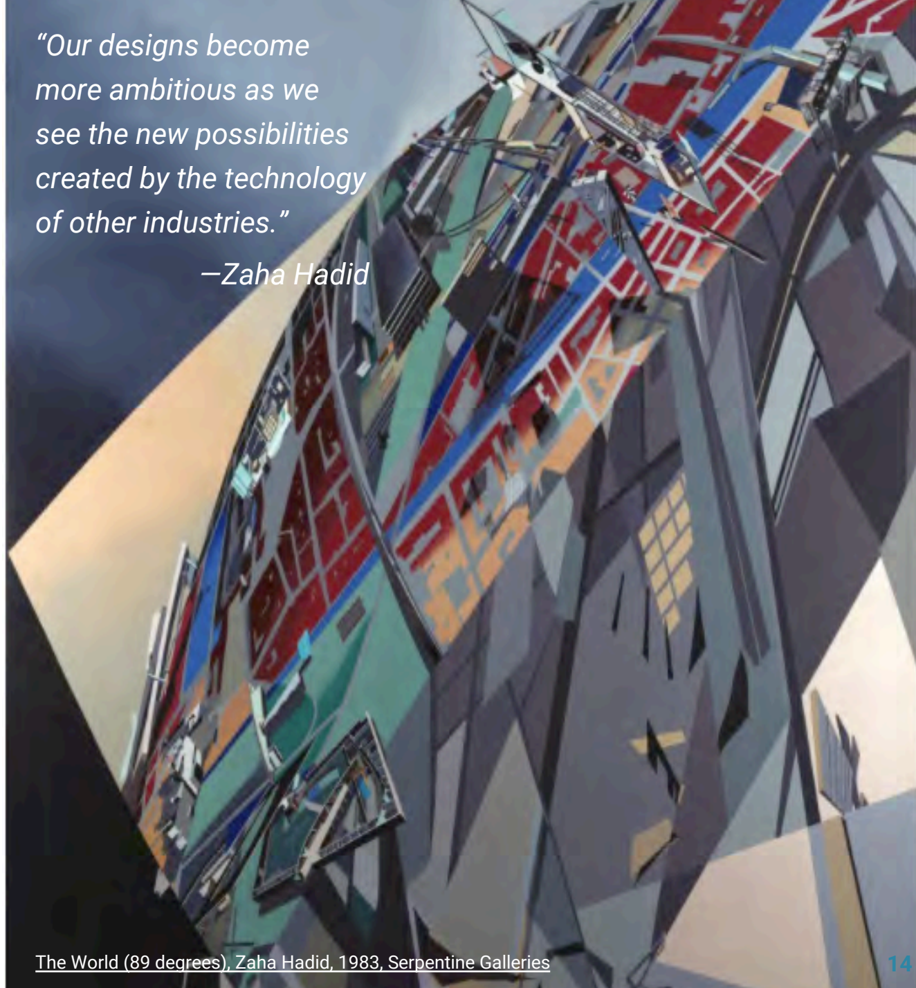
The World (89 degrees), Zaha Hadid, 1983, Serpentine Galleries