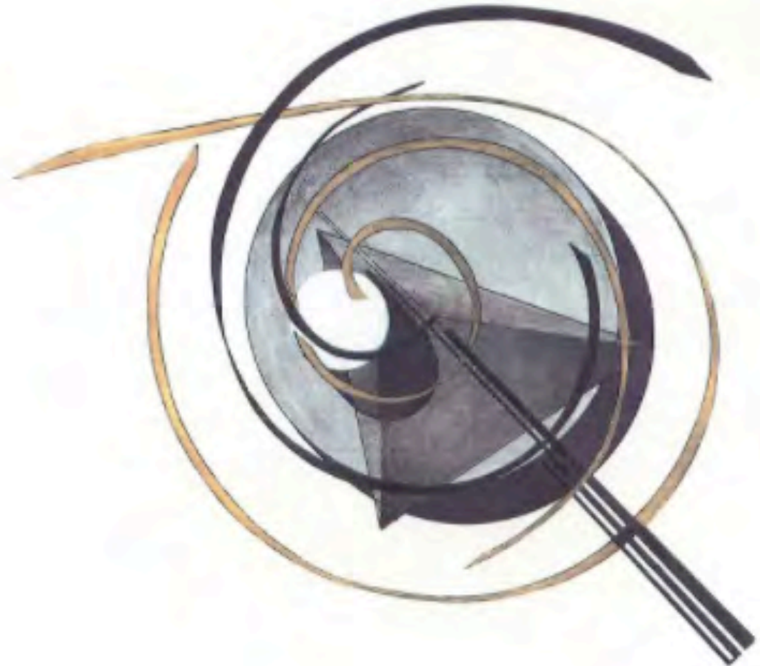
Interpretation of Tatlin's Spiral, plan, Zaha Hadid, 1992/1993, Serpentine Galleries

See more about the influence of Tatlin and the suprematism movement on Hadid's work here .