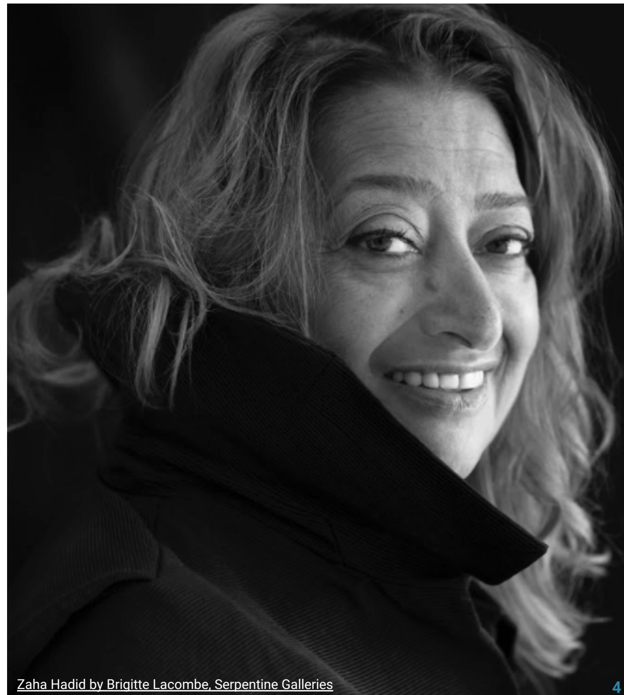
Zaha Hadid