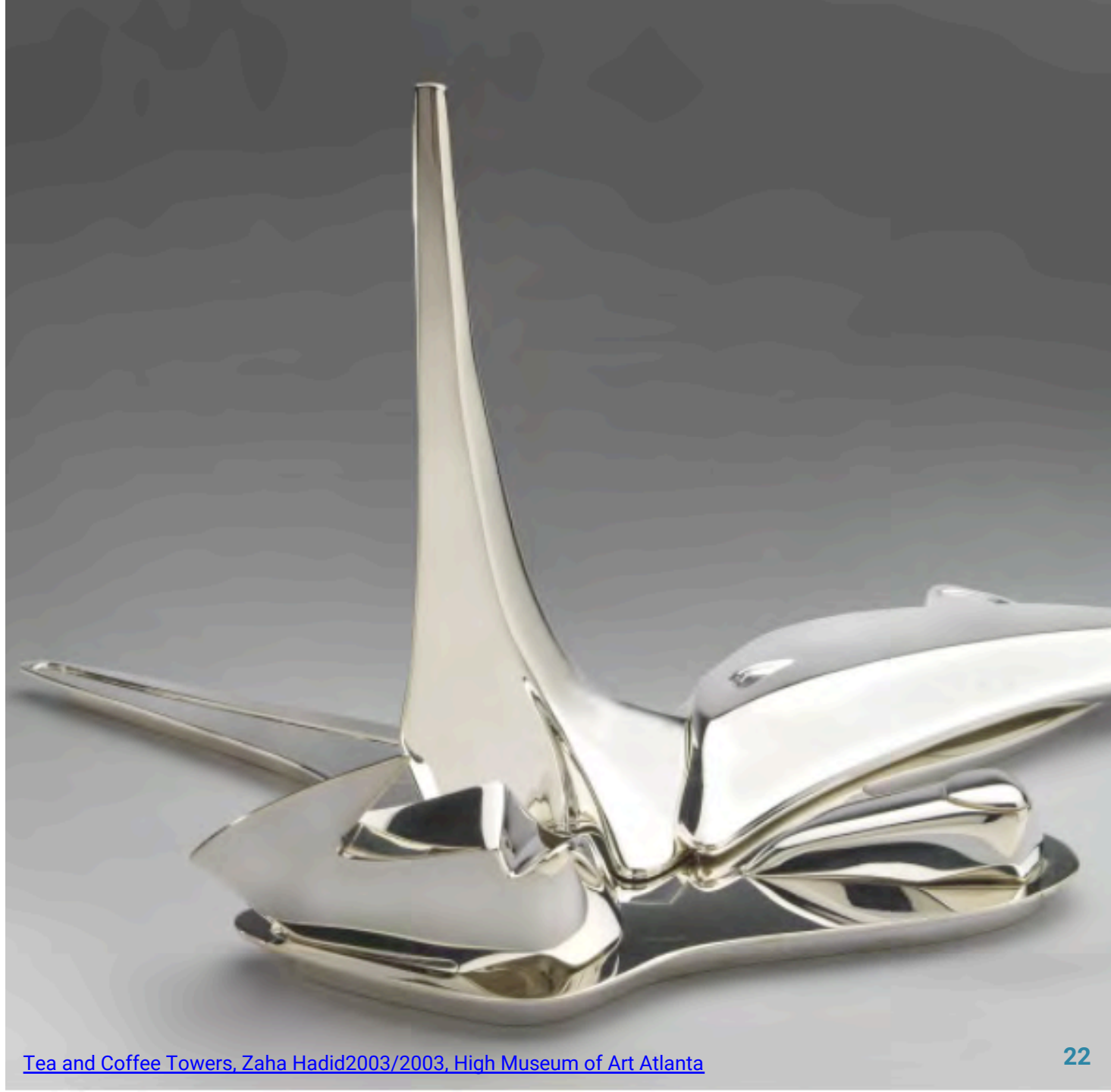
Tea and Coffee Towers, Zaha Hadid 2003/2003, High Museum of Art Atlanta

See another tea and coffee service designed by Hadid here .