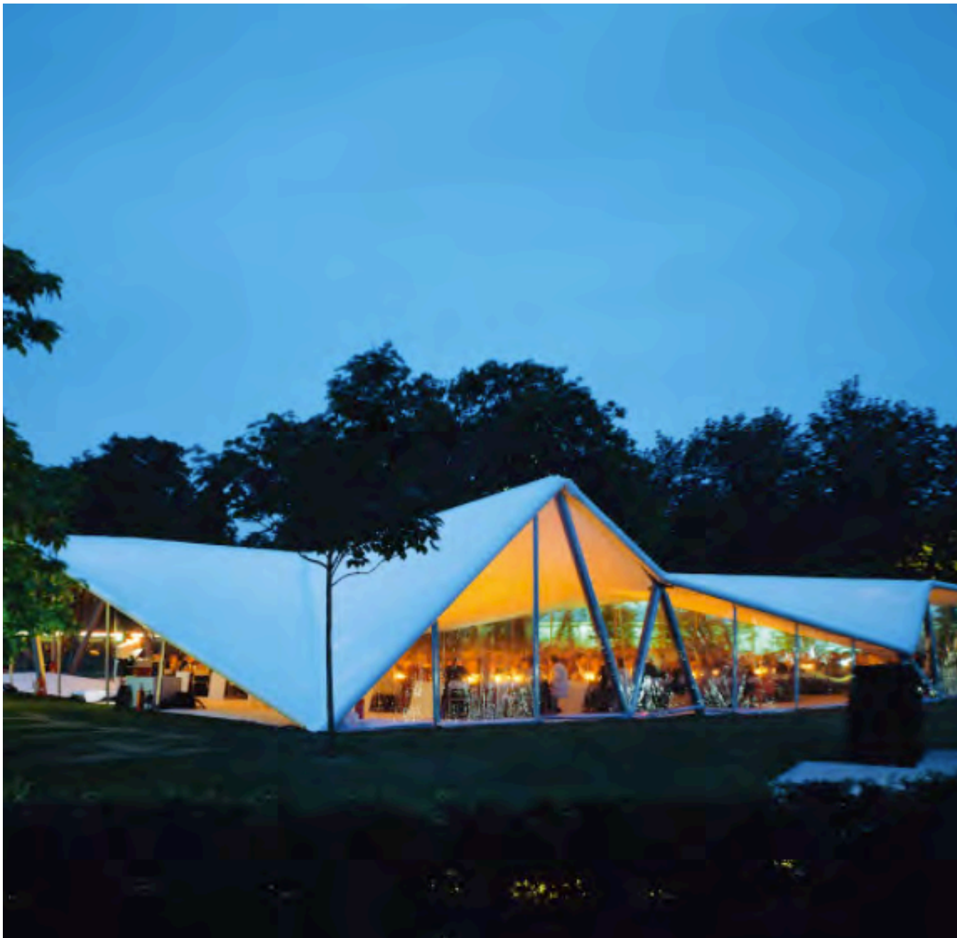
Reference Image, Zaha Hadid, Serpentine Galleries