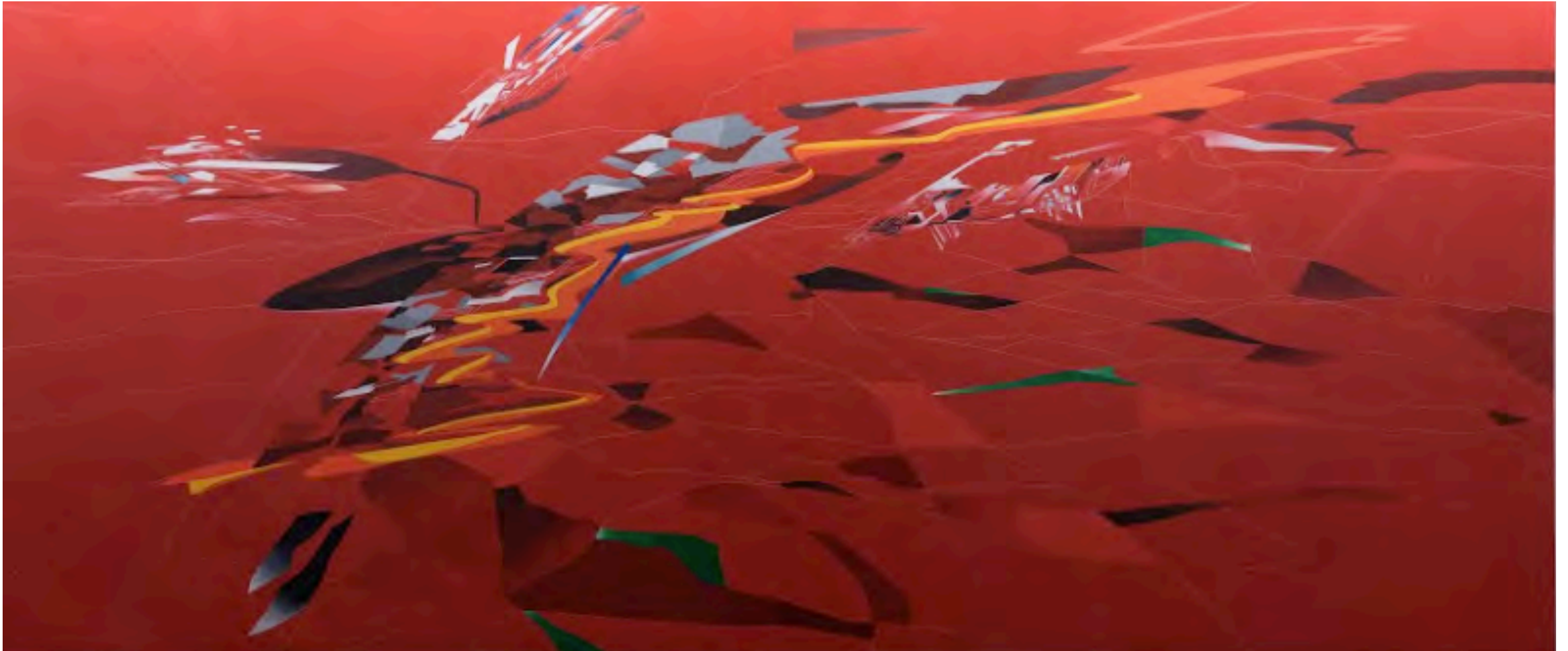
Zaha Hadid: Early Paintings and Drawings, Installation View, 2016, Serpentine Galleries

See an exhibition of Hadid's early paintings and drawings here .